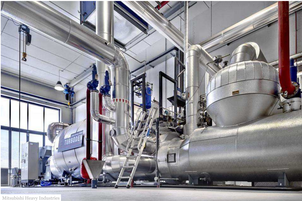
Mitsubishi Heavy Industries

How Güres and Turboden partnered to turn an environmental challenge into an innovative renewable energy solution [+]