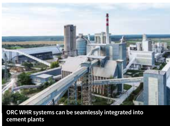
ORC WHR systems can be seamlessly integrated into cement plants

(see Figure 1). Unlike steam Rankine cycle (SRC) technology, ORC units use organic fluids such as hydrocarbons, silicon fluids or refrigerants to perform the thermodynamic cycle. The choice of fluid depends on the size of the ORC system and the temperature level of the exhaust gas. In cement applications, which are typically in the range of 1-20MWe, the most used organic fluid is cyclopentane.